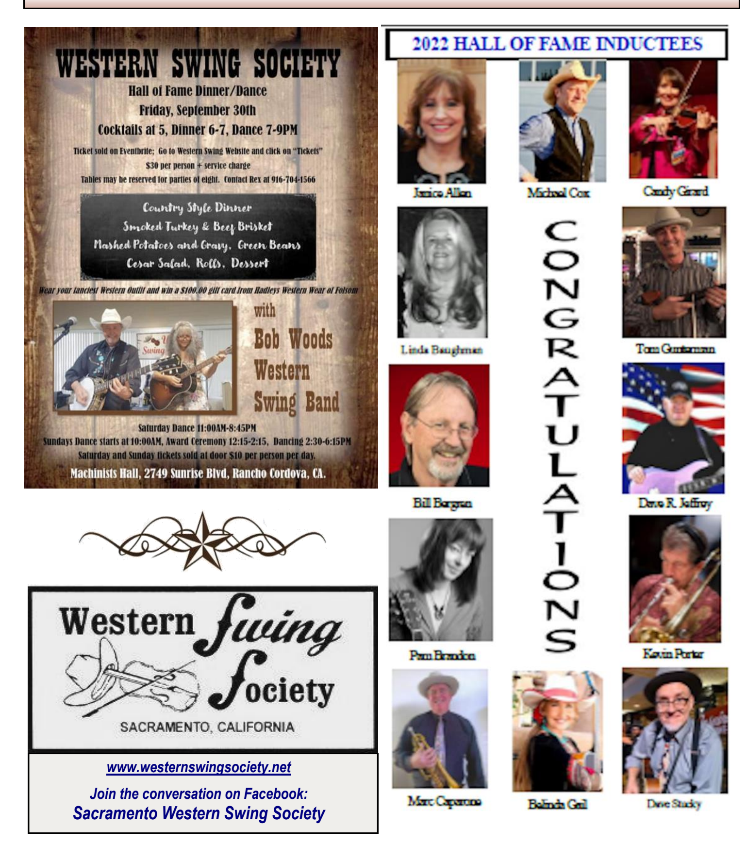
Our heartfelt congratulations to all of the WSS Inductees from your western swing family in the Great Pacific Northwest.