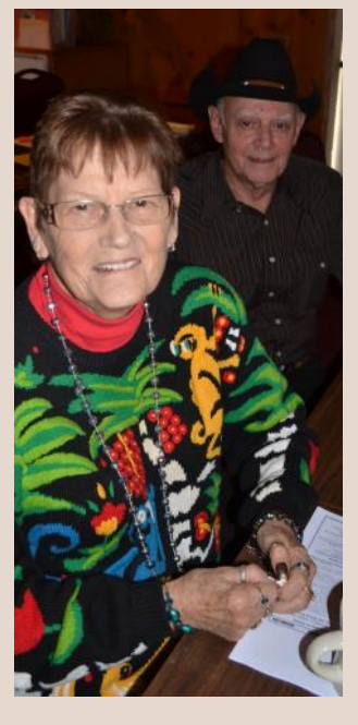
Hope to see everyone at the December Showcase. Save a smile for the camera!