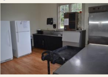
Above: Food prep area for those catering the event. Warming and cold storage for pre-prepared food only.

425-432-7888 or e-mail jeanneyearian@yahoo.com