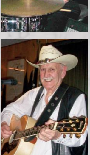
(ps) Please come out and support our local bands. It's most important!