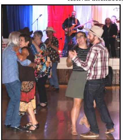
Dancing to the music of Southern Comfort during the 2018 Western Swing Festival

Music camp tickets can be bought at www.brownpapertickets.com/event/4101389 for $130. As of Monday, July 22, only a few spots remained.