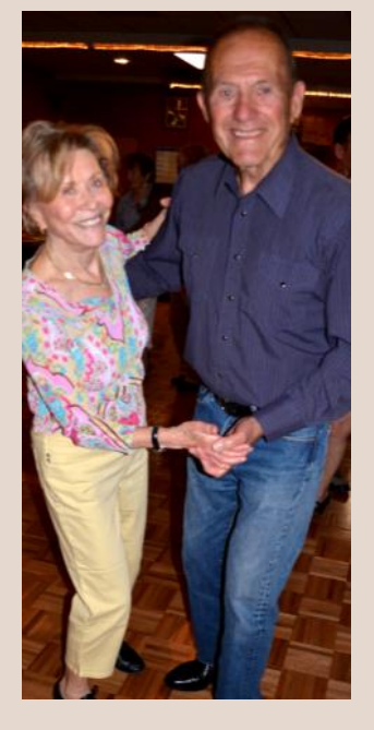
Hope to see everyone at the August Festival! Save a smile for the camera!