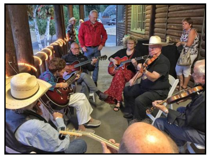
Jam sessions outside the Enumclaw Expo Center Field House will be a common sight during the Northwest Western Swing Music Festival, where people can bring their instruments and join in the fun.

She hopes that younger musicians will come to learn the Western Swing style and play along with some of the old timers. "It doesn't matter what your age is — when you're playing music together, it makes no different at all," she said. "There's not a lot of things multiple generations can participate in together on an equal level."