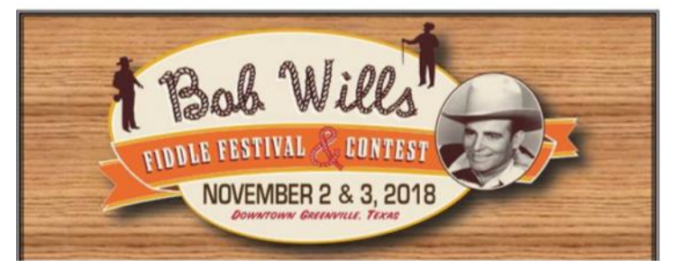
Congratulations, Paul, from your western swing family here in the Northwest! You make us proud!