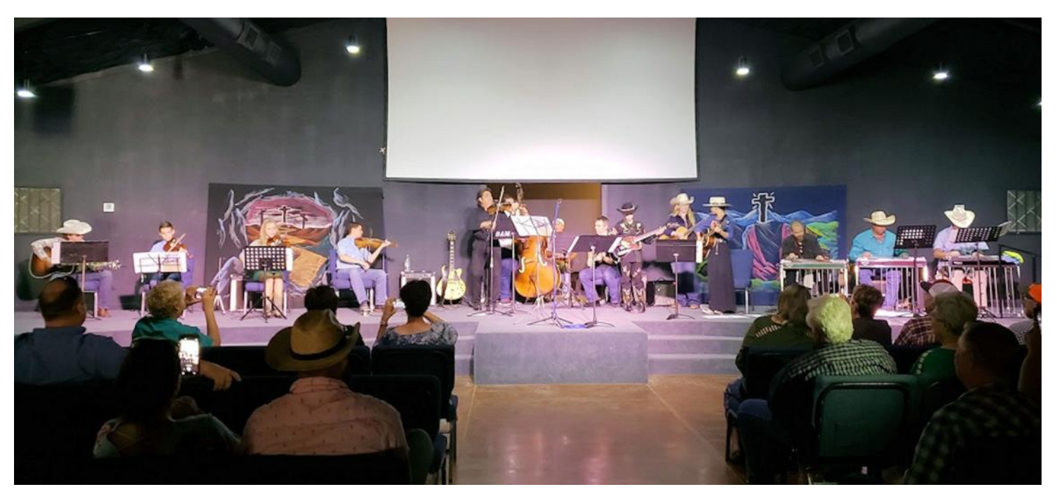
The Thursday afternoon recital for parents, grandparents, camp staff and several local guests