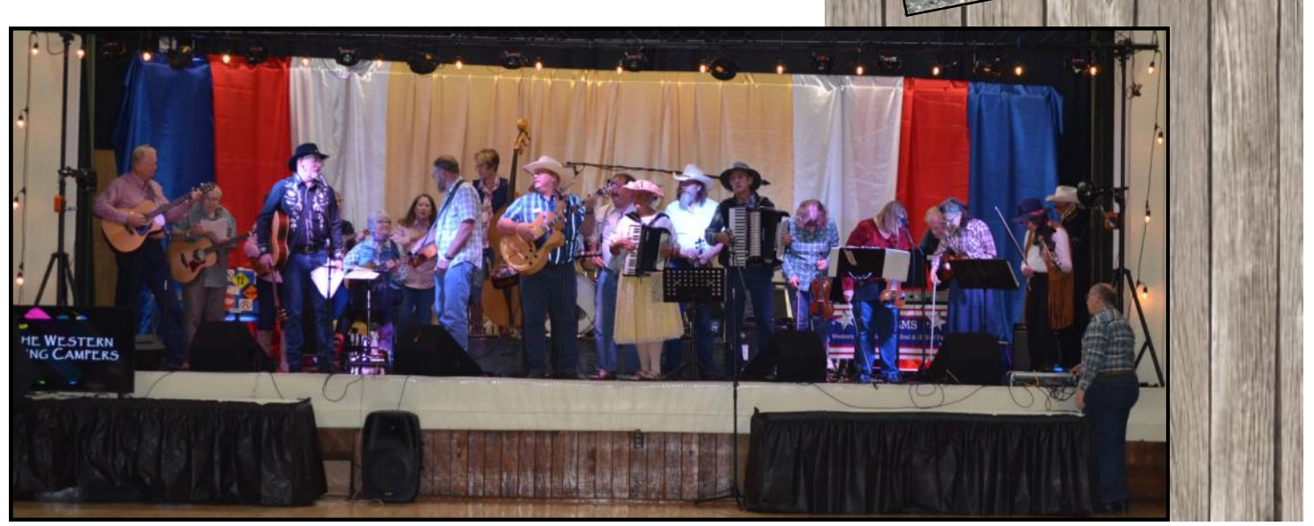
Opening Day 2 of the festival on Saturday afternoon were the 'Western Swing Campers.' With a little encouragement from their instructors, they took the stage and after a brief sound check began playing. They were incredible! In no time, the dancers were filling the floor! (Someone counted 20 musicians on stage - setting a new record and challenge for the Sound Man - pictured lower right.)