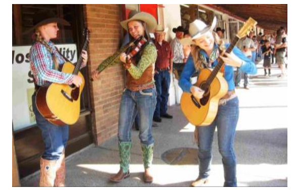
taken on Exchange Avenue, Fort Worth Stockyards, during the 2014 Red Steagall Cowboy Gathering.

The last horse had passed when I heard something dear to my ears, Faded Love played Bob Wills style. I looked to see three pretty young ladies, one fiddle, two guitars.